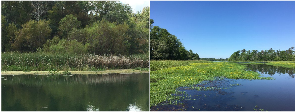
Figure 2: Aquatic Weeds on Lake Seminole FL/GA